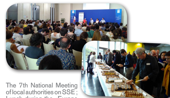
The 7th National Meeting of local authorities on SSE ; Lunch during the «Europe & SSE» meeting.

RTES organizes national and local meetings on different subjects in order to enable representatives and officers to discuss their experience, to share their assessment and to think about the integration of social economy into public policies. For example, RTES organizes a yearly meeting with local authorities in order to discuss the main issues about social economy.