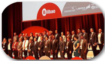
Tribune of local representatives during the 2018's GSEF in Bilbao ; a meeting of the GECES in Brussels.